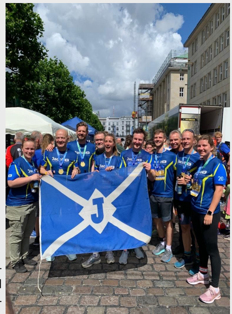
The Jacob Warriors celebrate!

And now the fun part starts - after the triathlon ends, the training for the next begins. See you in 2023!