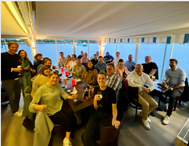
The entire Jacob team sharing a celebratory evening after the Triathlon event.