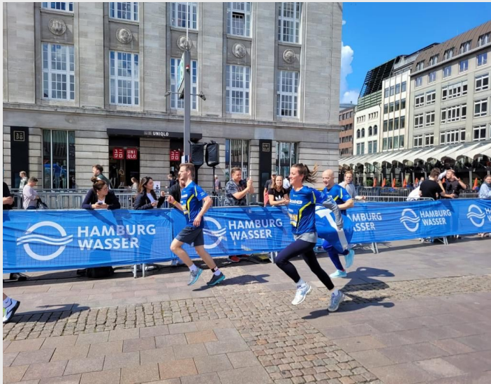
The IRON TEAM sprint to the finish line!