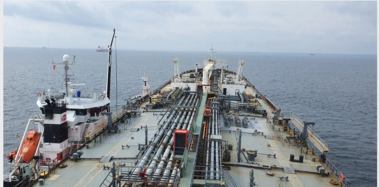
MT Nordic Basel sailing to Ventspils

an unannounced Alcohol test, Lifeboat Waterborne Drill, commanding the vessel under the supervision of the Master and much more. I was able to help with unloading stores and even enjoyed a short day trip ashore in Ventspils while the vessel was loading.