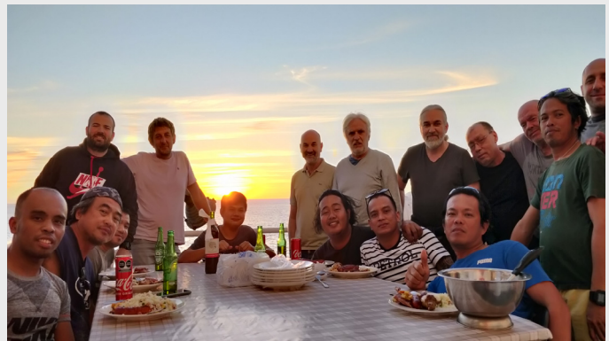
Dinner with a view - the crew from Nordic Basel enjoy a great view, greater food and the greatest company—eachother!