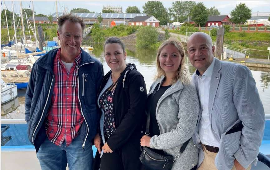
Technical and Marine colleagues at a Supplier Event