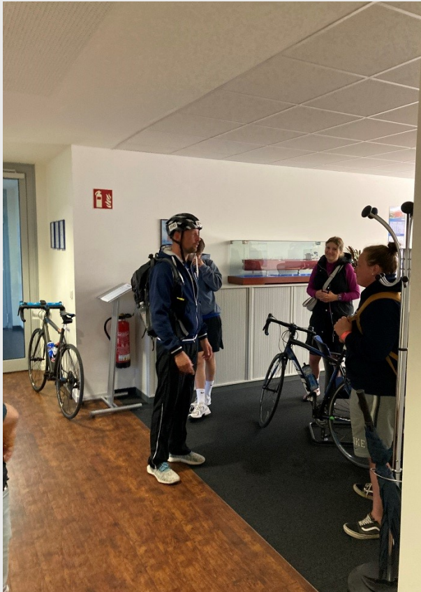
Calm meet up at Cremon 32 before the adrenalin rush!