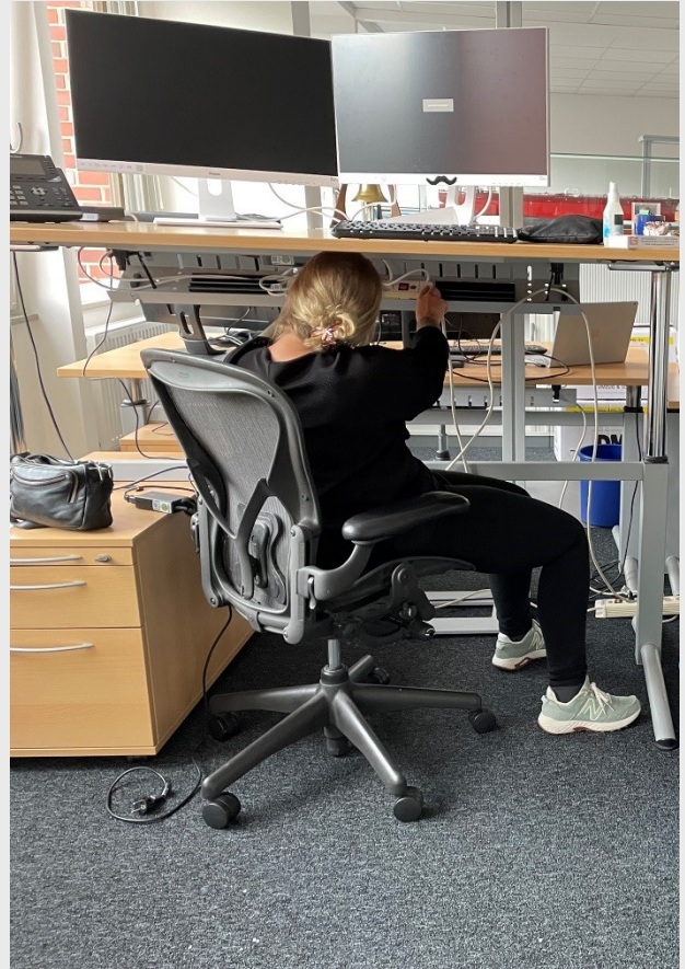
EJ team earning their office construction badges!