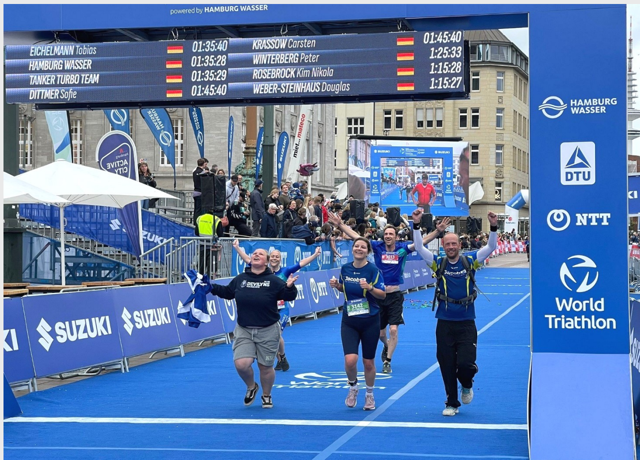
Tanker Turbo Team 2 cross the finish line!