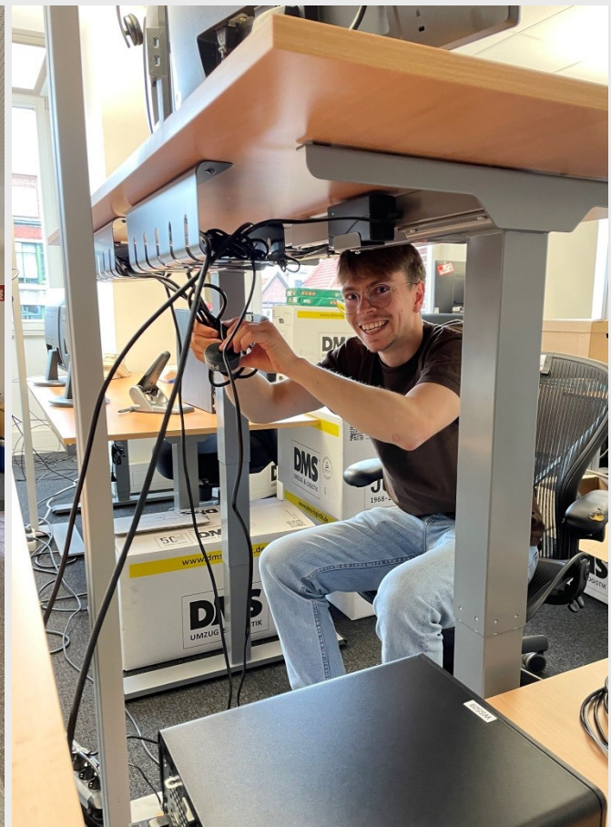
Moving day and all chip in to set up their stations and reap the lunchtime rewards