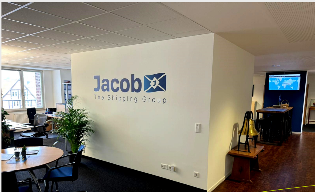
Welcome to Cremon 32!