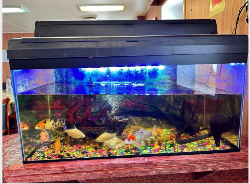
Newest addition to the Clearocean Fuku crew